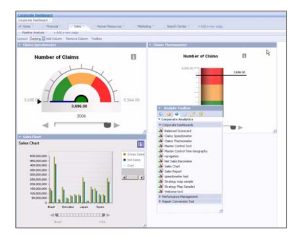
Figure 1: Monitor Business Performance and Make Informed Decisions

With a consolidated view of business performance, BusinessObjects™ Dashboard Builder XI from Business Objects, an SAP company, provides boundless visibility across the organization – delivering confidence in your business decisions.